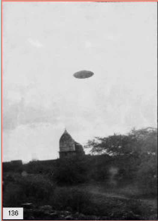
Photo by Meier on 3 July 1964 of the ashram showing Asket's UFO. Meier's photo #136 in his Photo Verzeichnis. Courtesy of E. Meier and M. Hurley. Click on the photo for full-size view of the saucer craft with brightness enhanced.

Billy Meier's first UFO sighting, followed by contacts from an elderly alien named Sfath, occurred as a child. They were followed up by further contacts as a young man under the tutelage of an alien woman called Asket, in the 1950s and early