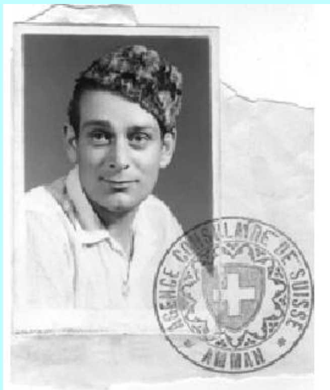
Passport photo of Billy's visa for Jordan issued by the Swiss consulate in Amman in 1963. From FIGU Bulletin No. 29 (Sept. 2000).

his Swiss contacts commenced and he was allowed to take many "beamship" photos and 8mm movie-film segments of them, upon