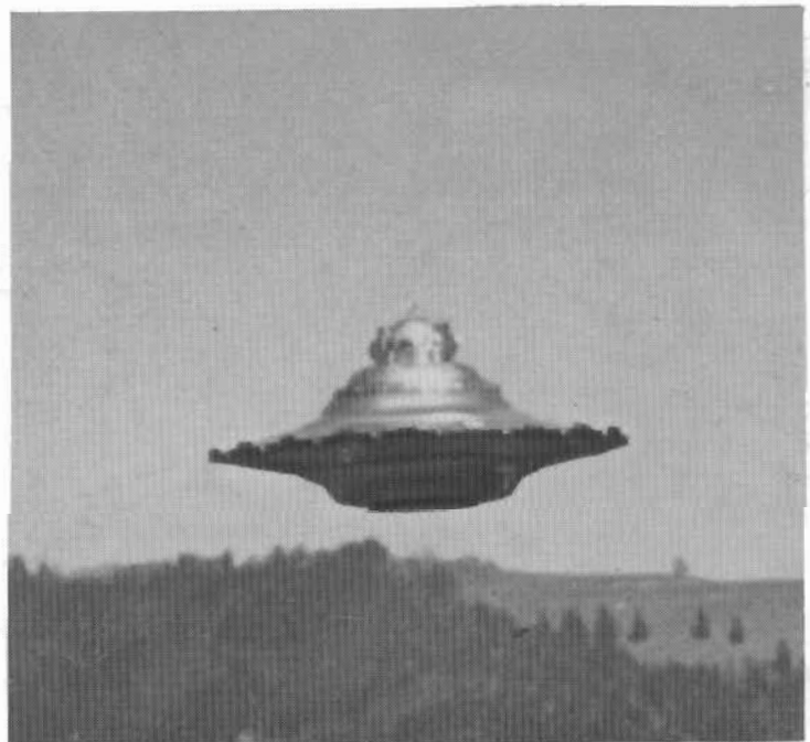
Photo taken in Switzerland by Eduard "Billy" Meier of a "Pleiadian Beamship".