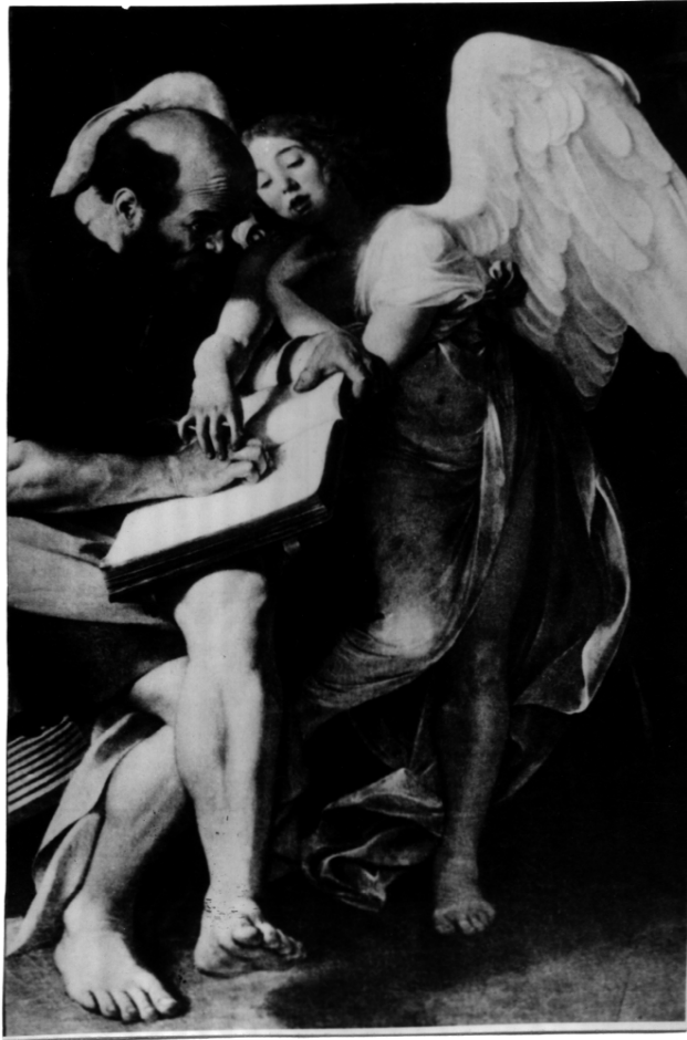
Picture: The painter Michelangelo da Caravaggio (1573 - 1610) depicted automatic writing in his picture "THE HOLY MATTHIAS WITH THE ANGEL",

The term politician applies to someone who is actively involved in politics. This certainly was not the case with CHRIST.